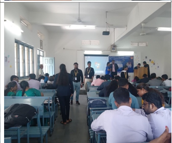
Inaugural Meeting and Students in different events.

A handwritten signature in green ink on a white background.